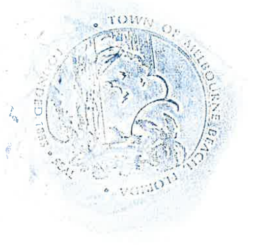
Interim Town Clerk

Brevard MPO/South Beaches Coalition Interlocal Agreement2